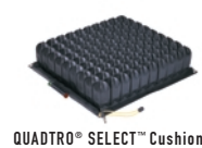
QUADTRO ® SELECT ™ Cushion