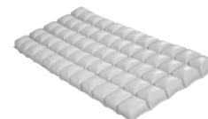
PRODIGY Mattress Overlay ®