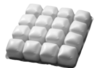
MOSAIC ® Cushion